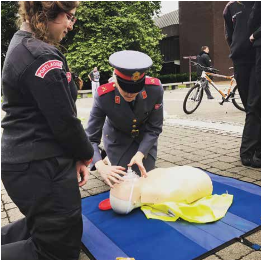
Order of Malta's Chief Medical Officer demonstrates CPR during a training day for cadets.

respond when the chief pharmacist in some hospitals needed medicines delivered to vulnerable people around the country. Those vulnerable people included not just the elderly, but people living with HIV, tuberculosis and cancer."