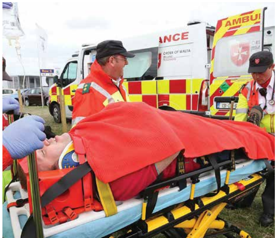
The cancellation of big concerts and events, such as the National Ploughing Championships, during the Covid-19 pandemic has hit the income stream of the Order of Malta.

"The situation was changing so rapidly in the early days – on one